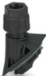
EVO plastic cable gland with bayonet locking, for housing series B, size M20, cable diameter: 7 ... 13 mm

Please be informed that the data shown in this PDF Document is generated from our Online Catalog. Please find the complete data in the user's documentation. Our General Terms of Use for Downloads are valid ( http://phoenixcontact.com/download )